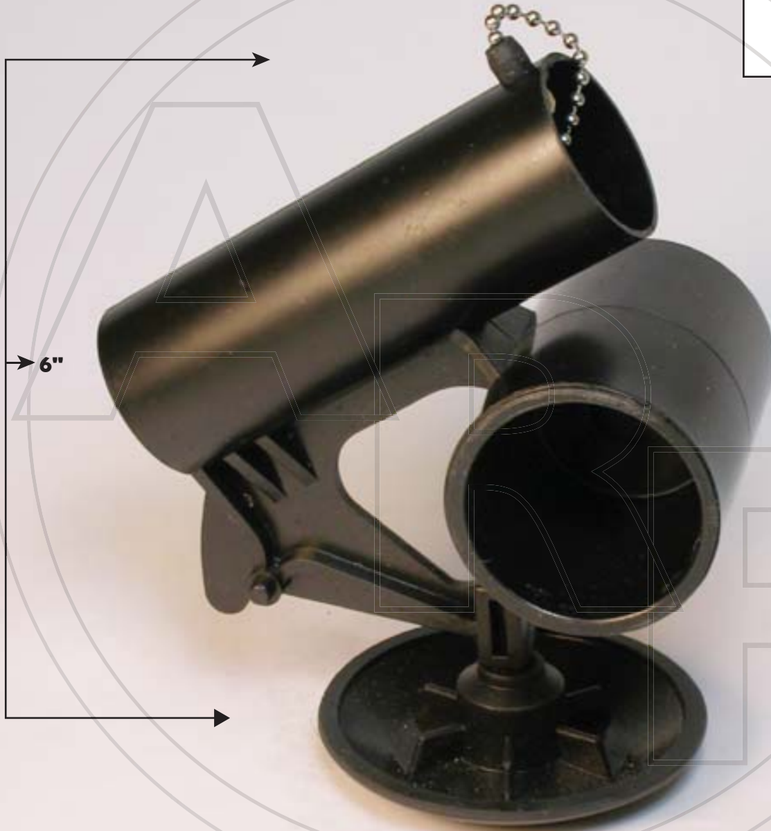
SNAP ON DISC